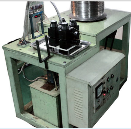
Wire Rolling Machine