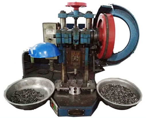
Punching + slotting equipment