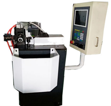
CNC Machine 2nd